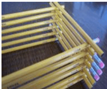
Rustic Cottage on Pasqua Lake.